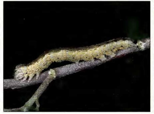
instar (lateral view).